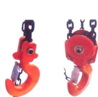
0.5, 1, 1.5, 2T